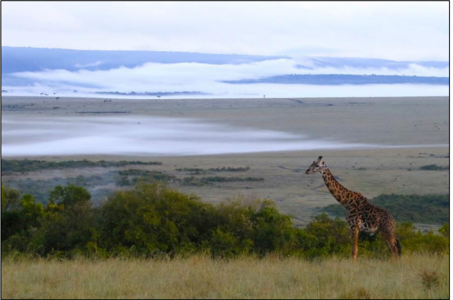
Masai Giraffe on the Masai Mara

Yellow-bellied and Jameson's Wattle-eye as well as some superb Lühder's Bushshrike. The forest also produced many Greenbul species, all somewhat similar looking and Grey-winged, White-browed and Snowy-crowned Robin Chat. White-breasted Nigrita was a nice surprise and we also connected with Grey-throated, Yellow-spotted and Yellow-billed Barbets.