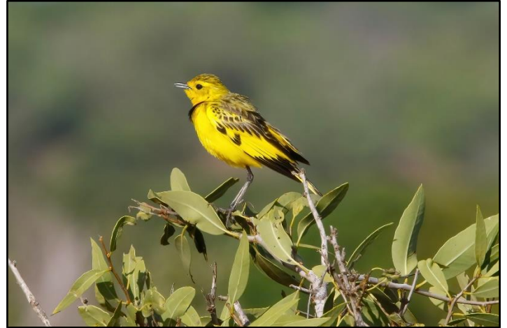
“Red” Elephant of Tsavo East & Golden Pipit

delightful tiny Sokoke Scops Owl. A group of 4, rather wet from one of the rain downpours showed superbly in a small scrubby area and we all got excellent views. Over the next couple of days, we caught up with Crab Plover, White-fronted Plover and numerous species of shorebird, Sooty Gull, Chestnut-backed and Retz’s Helmetshrike as well as some local specialities such as East Coast Akalat, Forest Batis, Amani Sunbird, Tiny Greenbul and Black-headed Apalis. Sokoke Pipit proved to be frustrating, and we heard one and just had a brief view as it flushed from the forest floor. Fischer’s Turaco were far more obliging, and we obtained excellent prolonged views.