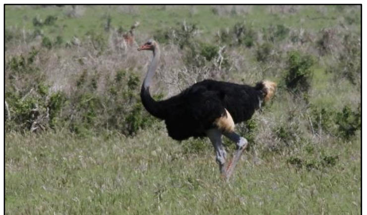
Pink-breasted Lark & Somali Ostrich