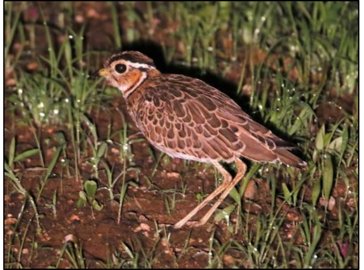
Hunter's Sunbird & Three-banded Courser

breasted, a probable Friedmann's (it didn't sing!), numerous Red-winged Lark and Chestnut-headed Sparrow Larks. Harlequin Quail was a nice bonus and a super male Pallid Harrier delighted with its elegance.