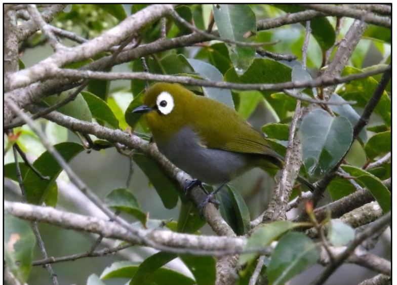
Taita Thrush & Taita White-eye