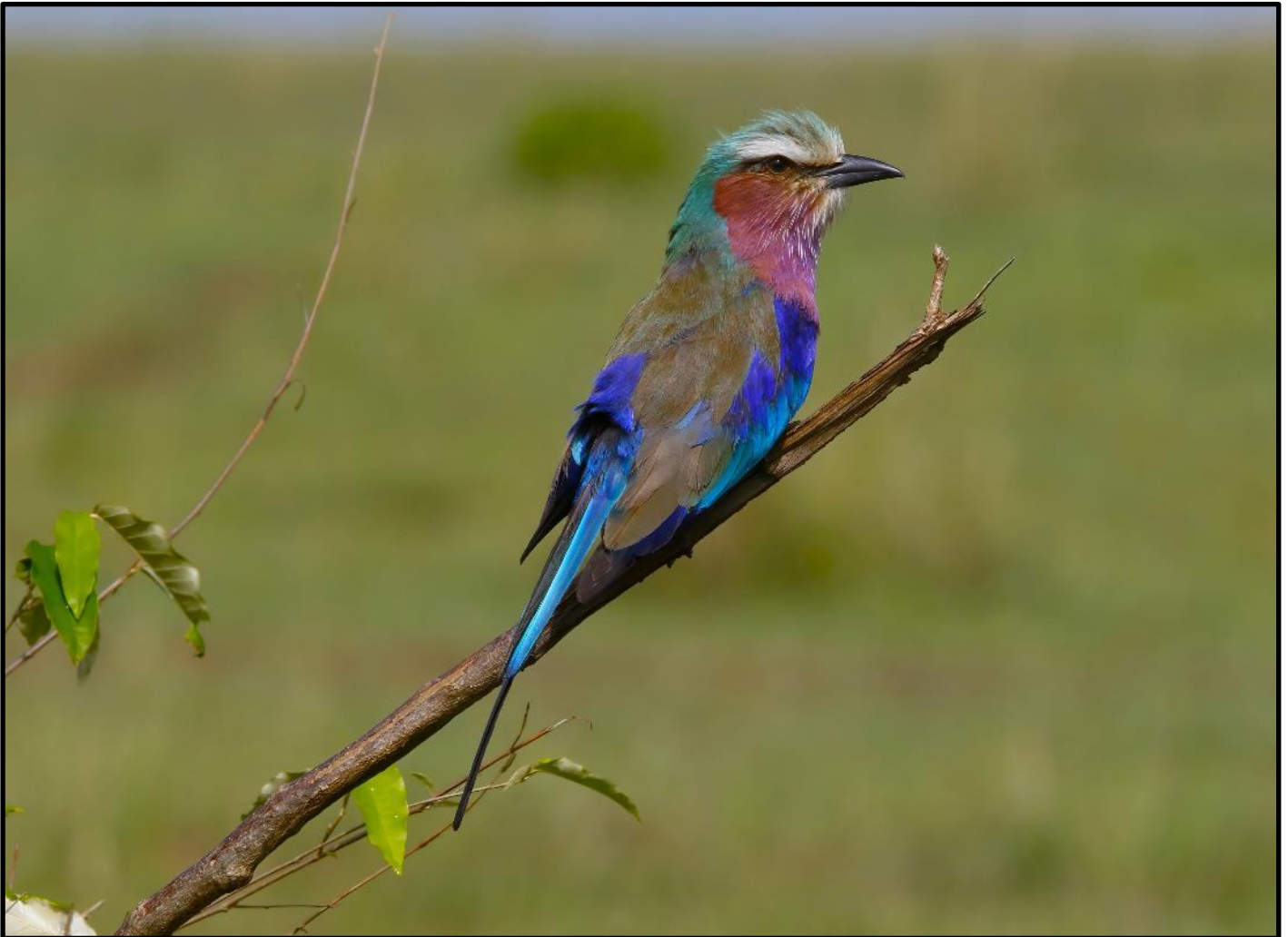
Lilac-breasted Roller in the Masai Mara