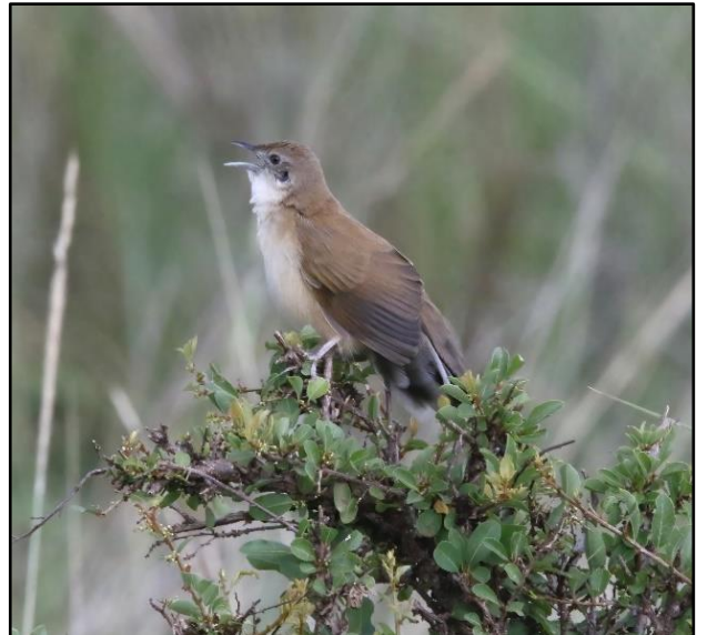
Pallid Harrier Fan-tailed Grassbird