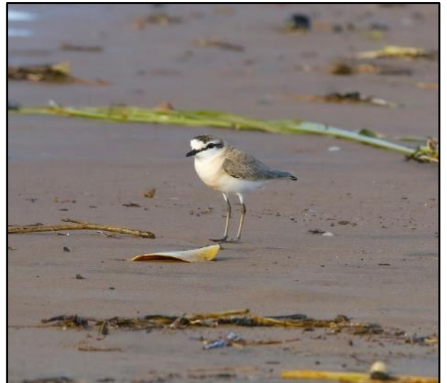
Sokoke Scops Owls & White-fronted Plover