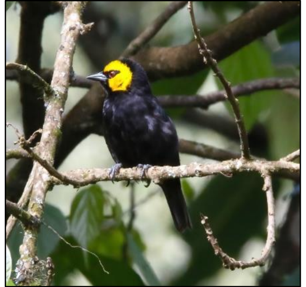
Lühder's Bushshrike & Black-billed Weaver

As we left Tsavo West on our final morning, one of the group spotted a Leopard right by the side of the track. We watched this superb animal for about 20 minutes before it slinked away into the bush. They really are impressive animals and always a real treat when you come across one.